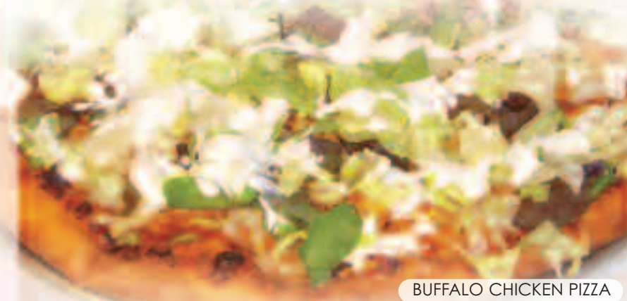
BUFFALO CHICKEN PIZZA

Extras: Pineapple • Banana Peppers • Jalapeños • Giardinera • Fresh Garlic • Anchovies • Extra Cheese