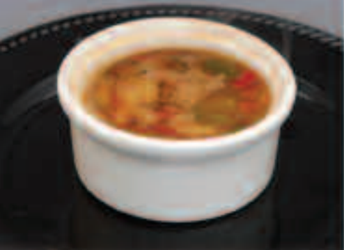
FIERY ROASTED VEGETABLE SOUP